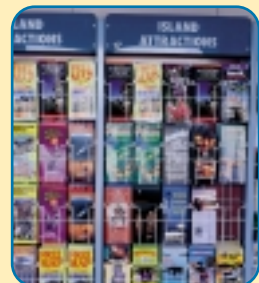
Brochure distribution with 6 & 12 month programs.