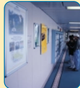
Onboard/terminal poster and coupon advertising.