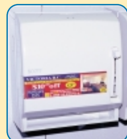
Various unique advertising opportunities that work (hand towel dispenser ad shown.)

Certified Folder Display Service Canada, Inc. offers several advertising opportunities to reach the millions of visitors and local residents who travel on BC Ferries' routes each year. All programs have been designed to allow you, our advertiser, to target your market. Our programs include the following: